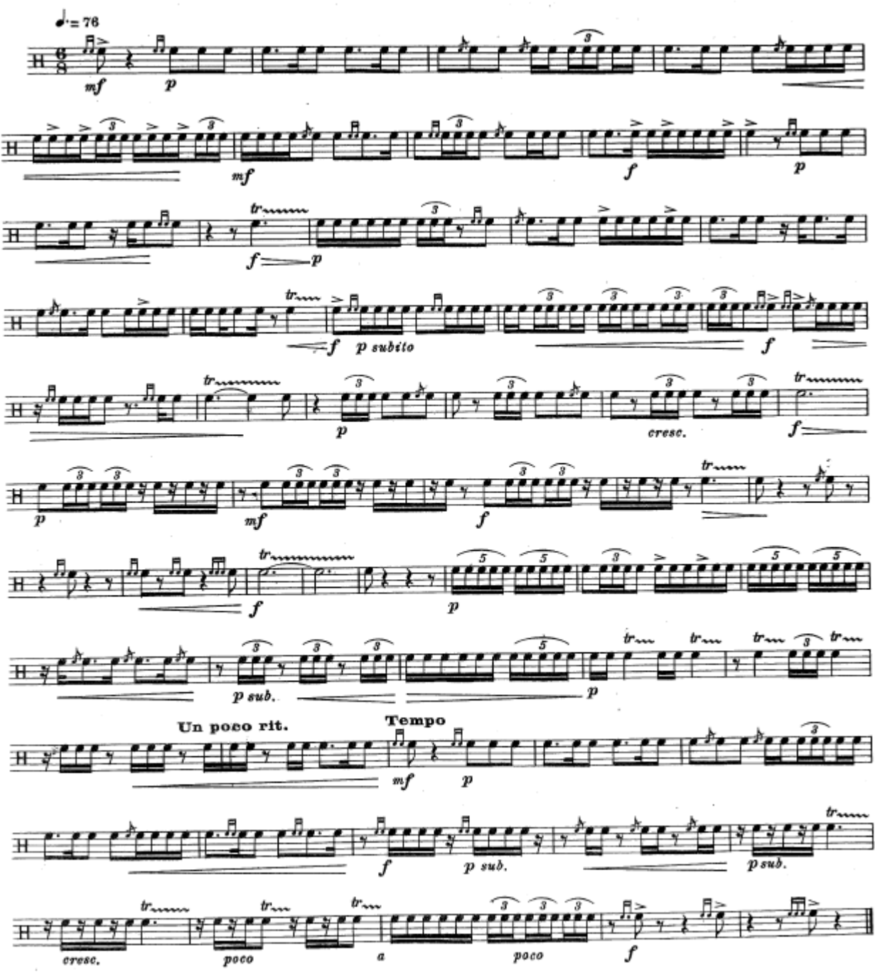
FOR EDUCATIONAL PURPOSES ONLY

Jacques Delecluse: Etude No. 1, from 12 Etudes for Snare Drum